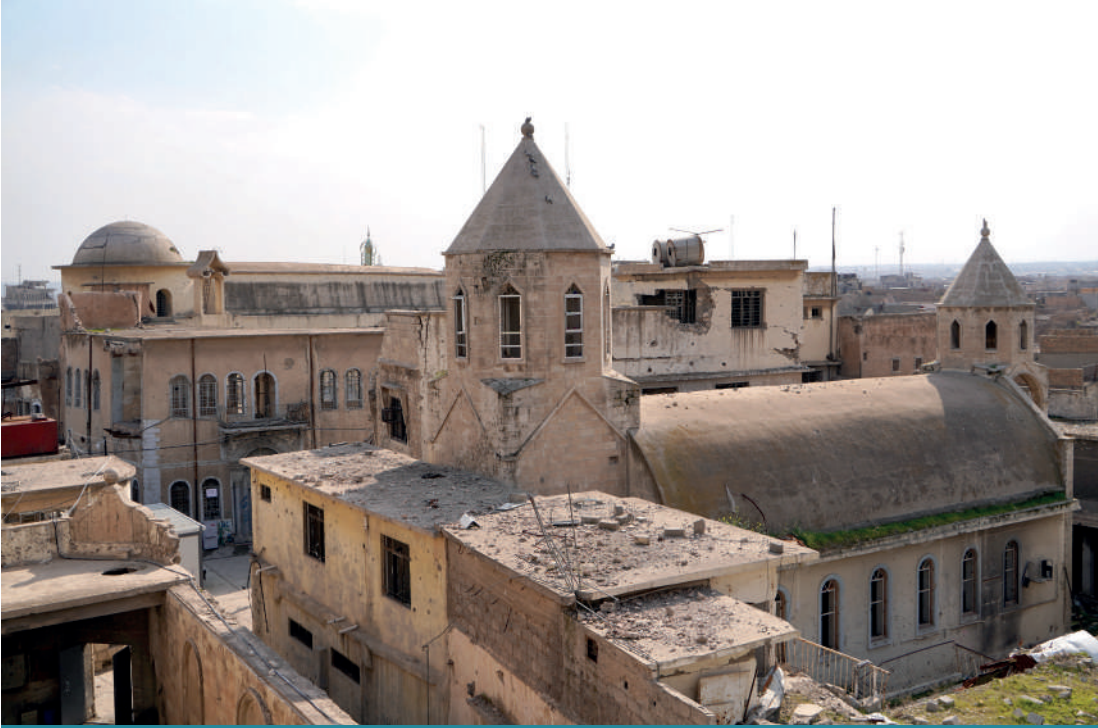
Hosh Al-Bayaa Square with four historical churches in Iraq's Mosul

the operations against ISIS in Mosul and its acquisition of dominance in the region as a result.