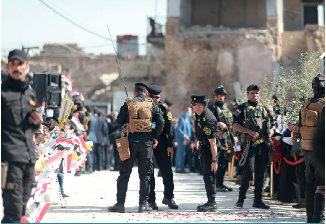
Pope's Visit to Mosul.

groups and remained almost entirely outside the control of Iraq. The locals provided a significant amount of support to ISIS. The rest of the population was displaced and migrated to other parts of Iraq. After its liberation, however, these areas came under the control and influence of the Hashd al-Ashairi, a tribal force subordinate to the Hashd al-Shaabi, thus shifting the balance of power from the terrorist groups represented by ISIS in favour of the Hashd al-Ashairi. A quarter of the inhabitants of this region live in camps set up for the displaced. Competition between those close to the Hashd al-Shaabi and the Sunni blocs is also increasing, and Hashd al-Shaabi supporters seem to be closer to victory. There is also a competition between the candidates of this constituency to close the camps and bring back ISIS fam-