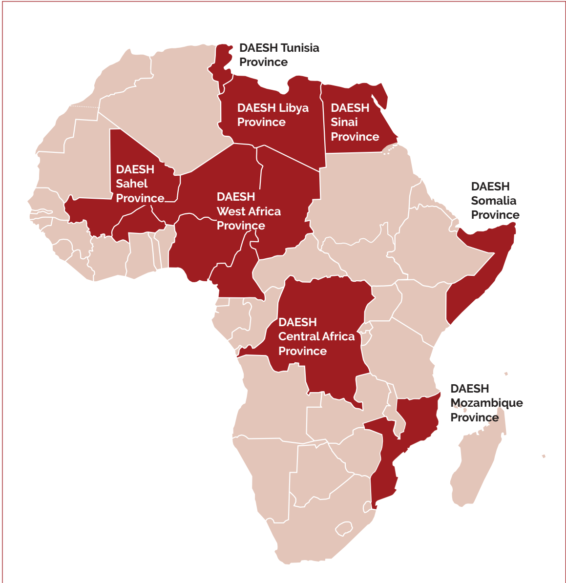
Figure 2: DAESH's African Provinces