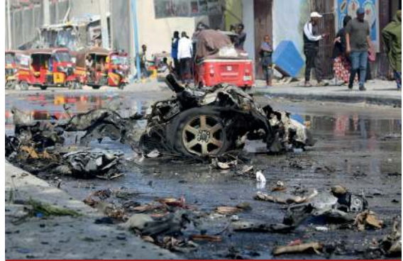
A view of damage after a violent explosion occurred at a restaurant near the Presidential Palace in Mogadishu, Somalia, Sept. 28, 2024.

DAESH's presence in Somalia began on October 14, 2015 when Abdulkadir Mumin, the former senior commander of al-Shabaab, pledged allegiance to then-DAESH leader al-Baghdadi. 17 Mumin also convinced a group of about 20-30 al-Shabaab militants from the Puntland region to join DAESH. Prior to pledging allegiance, Mumin was a prominent figure within al-Shabaab and served as a senior commander in charge of the group's operations in Puntland between 2010 and 2015. 18